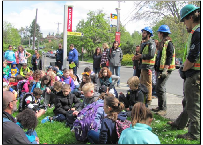
Genesee Hill students hear from EarthCorps trainees about Kilbourne restoration and how they hope to use their training.

WEBSITE. Webmaster Chris Nack faithfully maintained our web presence at www.fauntleroywatershed.org . By year's end, a total of 968 users had visited; 81.3% were new, 18.7% were returning, and just over half were from the greater-Seattle area. With development of a separate website for Salmon in the Schools - Seattle, Chris deleted those lesson plans from our website, contributing to a drop in page views from 3,915 in 2016 to 2,531 in 2017. Visitors most often headed to the map of Fauntleroy Park; creek education was the next most popular destination. Referrals from Google accounted for 46.5% of sessions, followed by coming direct (26.6%).