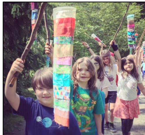
Singing and colorful flags energize students from Taproot School on salmon-release day.