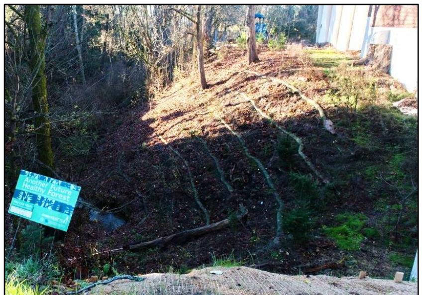
Coir logs hold rainfall in place as plants get established on the north slope.