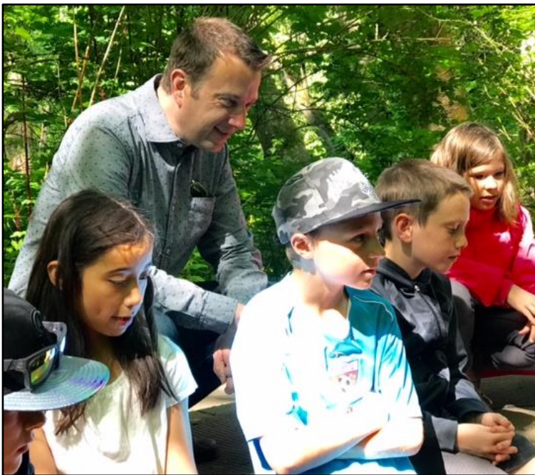
County Councilmember Joe McDermott enjoys a salmon release with Genesee Hill fourth graders.

ON THE RECORD: In February, a proposal before the City Council to allow homeless encampments on public/park property prompted us to comment on the side of protecting habitat and public safety. The council elected to retain the city's existing prohibition.