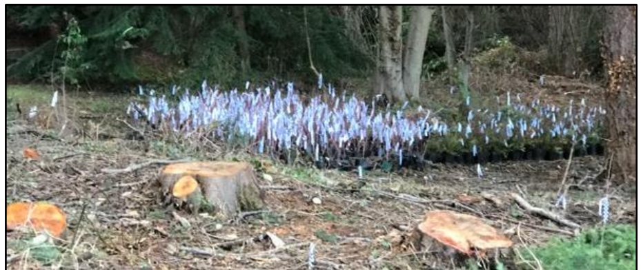
New plants stand ready to revegetate native habitat marred by illegal tree cutting.