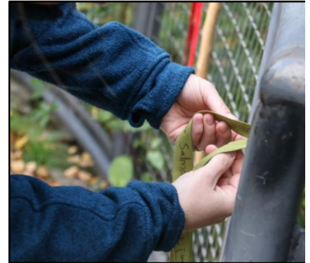
Streamers at the fish-ladder viewpoint proclaimed spawning season.

Our list of regular outreach opportunities through the calendar year now extends to 20, with most in the spring and fall associated with salmon activities.