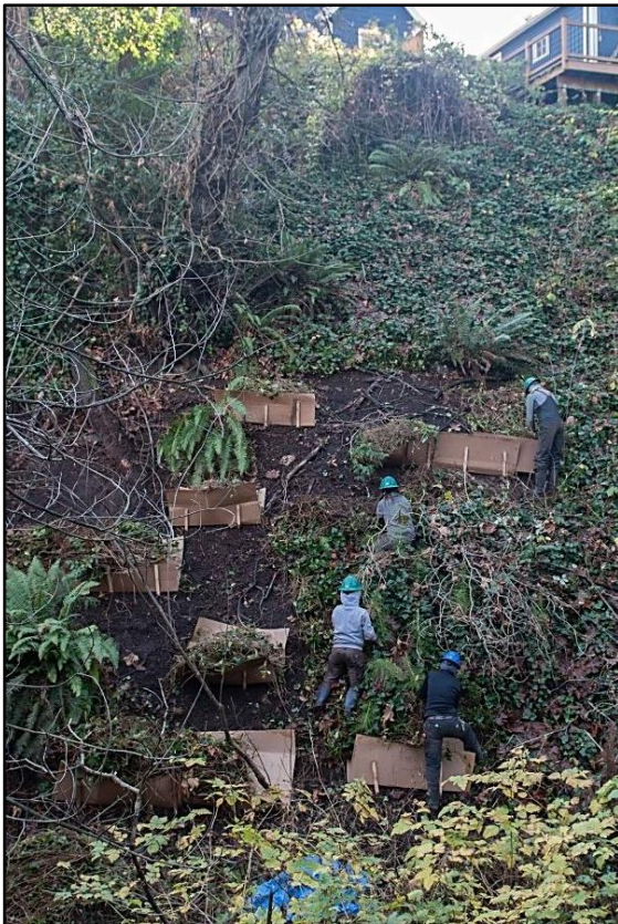
Clearing "survival rings" on the steep south slope will enable new plants to take hold without promoting erosion.