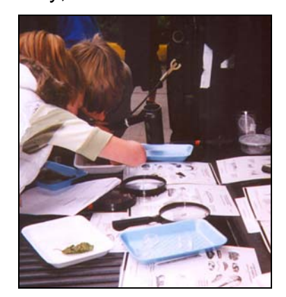
Arbor Heights students look closely to identify macro-invertebrates in their sample.

In response to the State Department of Ecology's focus on reducing fecal coliform bacteria in the creek, K-2 students at KapKa Cooperative Primary School began a second "poop study" in Fauntleroy Park. (The school completed the baseline study in 2004.) By the study's conclusion in May, teams will have recorded pet-waste deposits along the designated trail segment six times.