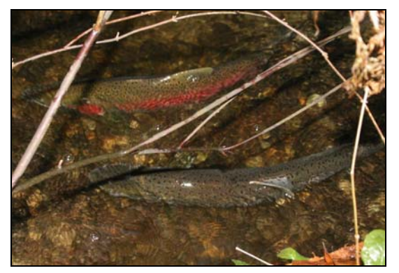
This year's coho spawners were vigorous and especially colorful.

Salmon Watch 2007 volunteers were rewarded in spades when they witnessed 89 coho spawners and one cutthroat trout in the creek. The fish held off until the second week of November and then poured in over a 10-day period. To augment weekly checks by members of Wild Fish Conservancy, volunteer biologist Steev Ward came daily to check carcasses for prespawn mortality, estimated by the city's recent Status of the Waters report to be about 38 percent in Fauntleroy Creek. Several redds were marked but, according to Dave Crabb with Wild Fish Conservancy, all the eggs likely washed out during an exceptional rainstorm in early December.