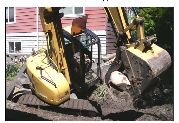
Tight quarters required careful planning and excavating to restore a natural channel without damaging adjacent homes.

After more than two years of fund-raising, designing, and permitting, we finally got "boots on the ground" in the fall to restore the last major degraded reach of the creek. Engineer Nick Silverman, excavator Scott Dutro, and a multi-national crew of EarthCorps trainees finished instream restoration on 40 feet of channel in the upper reach and rebuilt 200 feet of degraded channel to the beach. In