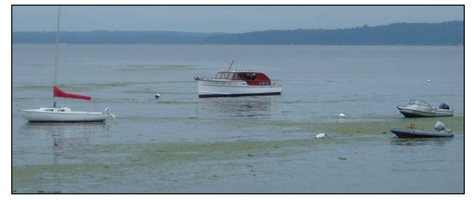
Boats anchored near the ferry terminal bob in a summertime sea of seaweed.

report in August, clearing the way for planning specific actions to decrease fecal counts. The Council responded immediately by initiating a follow-up study of pet waste in Fauntleroy Park (see "Supporting Research") and distributing biodegradable poop bags during the Fauntleroy Fall Festival.