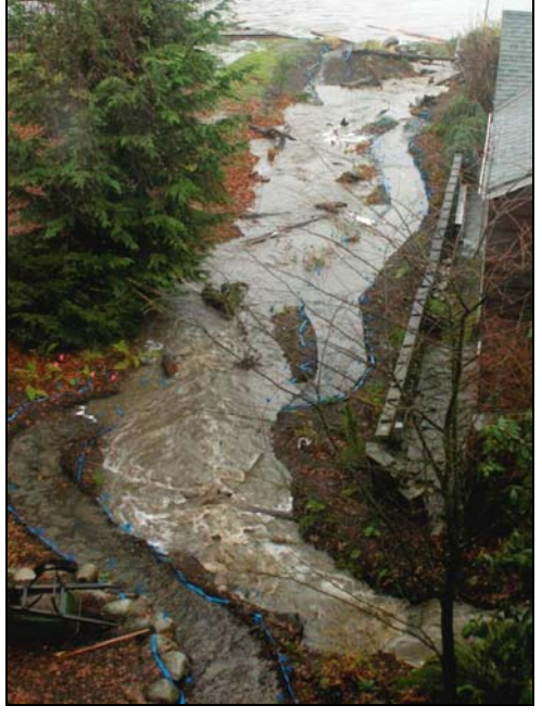
Heavy rain on Dec. 3 provided the first test of the rebuilt reach to the beach. When the torrent of storm-water receded, the well-engineered channel settled back into its banks.

Led by Sinang Lee and Dave Garland, the State Department of Ecology (with participation by Seattle Public Utilities staff) completed a "total maximum daily load" report about fecal coliform bacteria in the creek and cove. The regional office of the Environmental Protection Agency approved the